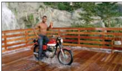
(Left to right) Wieden+Kennedy Portland's 'Questions', 'Born of Fire' and 'Rise'